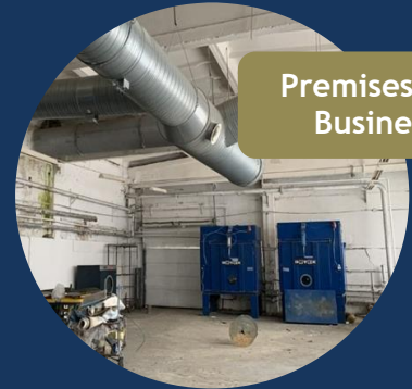
Premises For Business